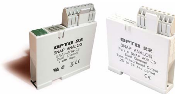
SNAP Analog Output Modules

Transformer isolation prevents ground loop currents from flowing between field devices and causing noise that produces erroneous readings. Ground loop currents are caused when two grounded